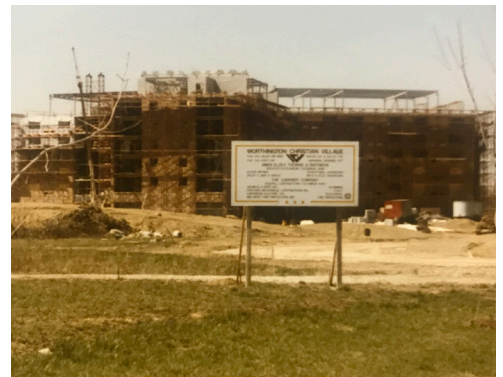
Worthington Christian Village while under construction