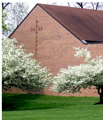
Chapel added in 1994-1995