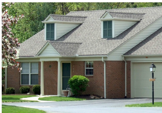
Cottage homes were added in 1995