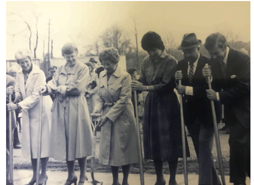
Worthington Christian Village groundbreaking in 1984

Of course nothing would have happened, and this ministry would not continue, without God's incredible faithfulness and His many blessings. We truly have so much to celebrate! Here's to 35 more years!