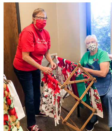
Volunteers from Westerville Christian Church working on their Christmas hand towel display

The Craft and Gift Show raised more than $10,000 to go toward the purchase of a new passenger bus for the residents. Thanks one and all for your help and support.