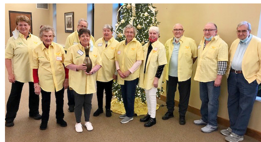
Our Wii Bowling Team showing off their trophy after their win against the Worthington Christian High School Bowling Team