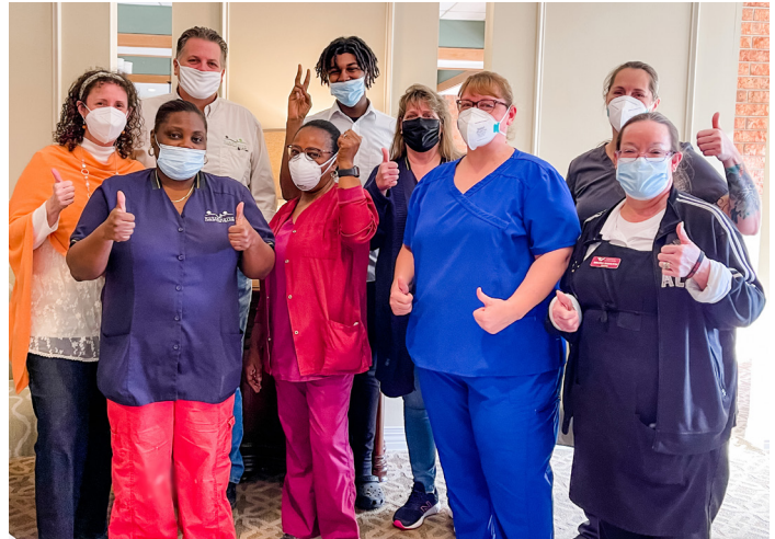
A group of some of our amazing employees. They truly make a difference each and every day!