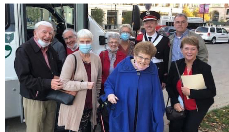
Residents pose for a group picture as they arrive to The Ohio State University Marching Band concert